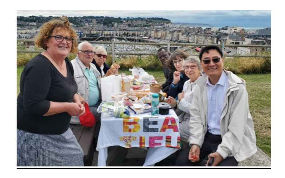
Pray for the local testimony in Dieppe to be strengthened and increased through this period of distribution and mutual shepherding!