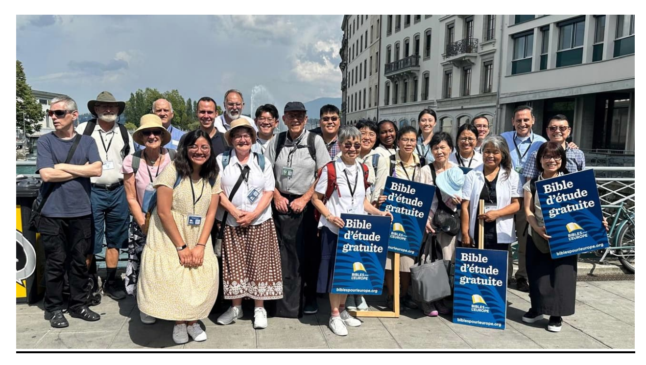
Lord, use the ones we have met to raise up the church in Geneva.