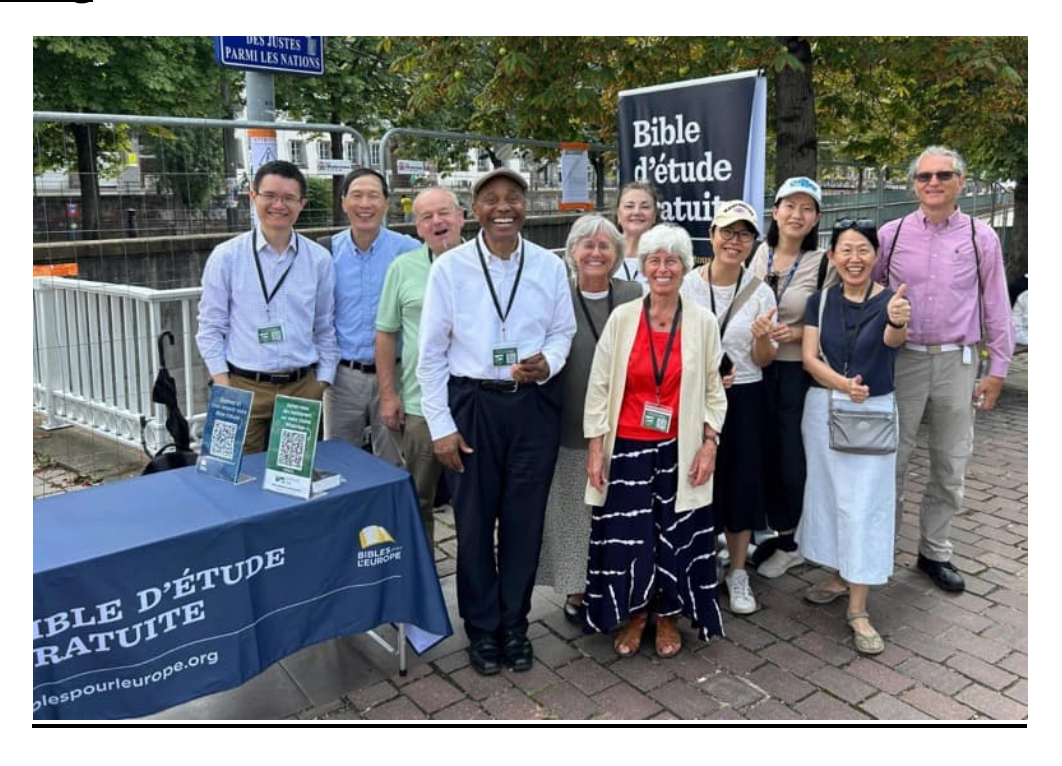
Lord gain these new ones for the church life in Strasbourg!