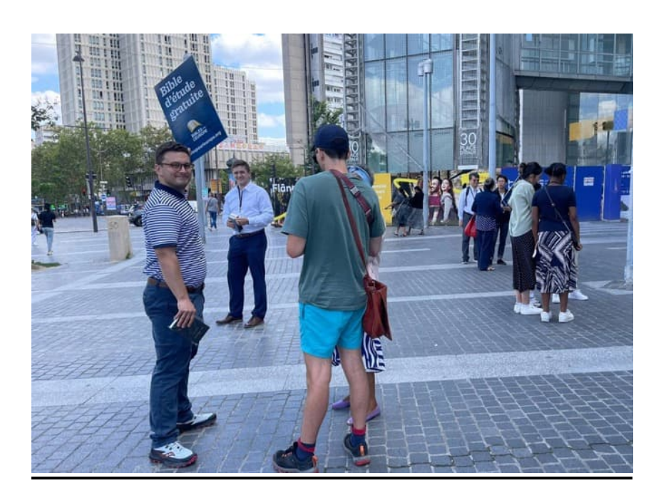
Lord, gain these ones for the church life in Paris.